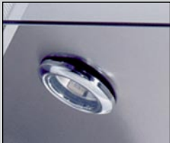
Two powerful halogen lights are directed to the center of the work surface.

A sweeping glass reveal is as beautiful as it is functional—a generous canopy captures the heat without blocking the view.