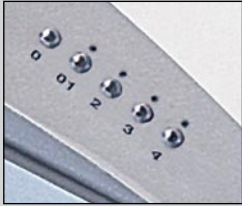
Electronic four-speed control. LEDs illuminate the selection.

Telescopic flue for 8' to 9' ceilings – Custom extensions available (see p. 50)