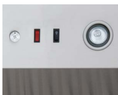
Bright halogen lighting and 4-speed control with illuminated ON/OFF indicator.