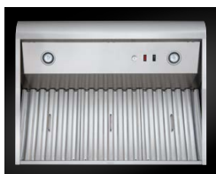
Large, easy-to-remove baffle filter and grease rail.

WPD38136SB WPD38142SB WPD38148SB WPD38160SB