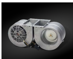
1200 CFM Internal Blower. Tested to ensure operation in corrosive environments.