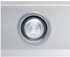
Halogen lamps brilliantly illuminate the cooktop.