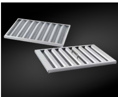
Hi-Flow baffle filters utilize a V-mesh & baffle design to increase airflow, decrease sound levels and provide excellent ventilation efficiency.