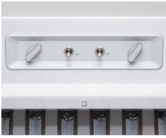
Infinite speed control with last setting memory.