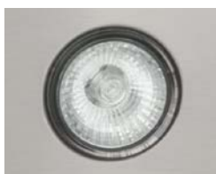
Bright halogen lighting.