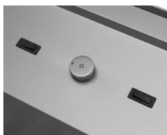
A variable-speed rotary control enables infinite blower speed adjustment.