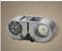
1200 CFM Internal Blower. Tested to ensure operation in corrosive environments.