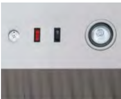
Bright halogen lighting and 4-speed control with illuminated ON/OFF indicator.