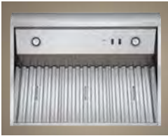
Large, easy-to-remove baffle filter and grease rail.

WPD38I36SB WPD38I42SB WPD38I48SB WPD38I60SB