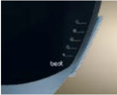
Four-speed Electronic control includes 10-minute delay-off and filter clean reminder.