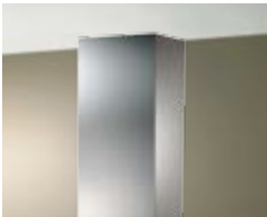
Optional decorative flue for ducted applications creates a unique look.