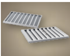
Hi-Flow™ baffle filters utilize a V-mesh & baffle design to increase airflow, lower sound levels and provide excellent ventilation efficiency.