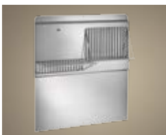
Optional professional style backsplash with built-in holding racks.