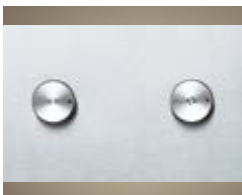
Rotary controls for two-level lighting and variable blower speeds enable the user to choose operating preferences.